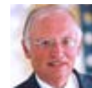
Günter Verheugen International Advisory Board Member